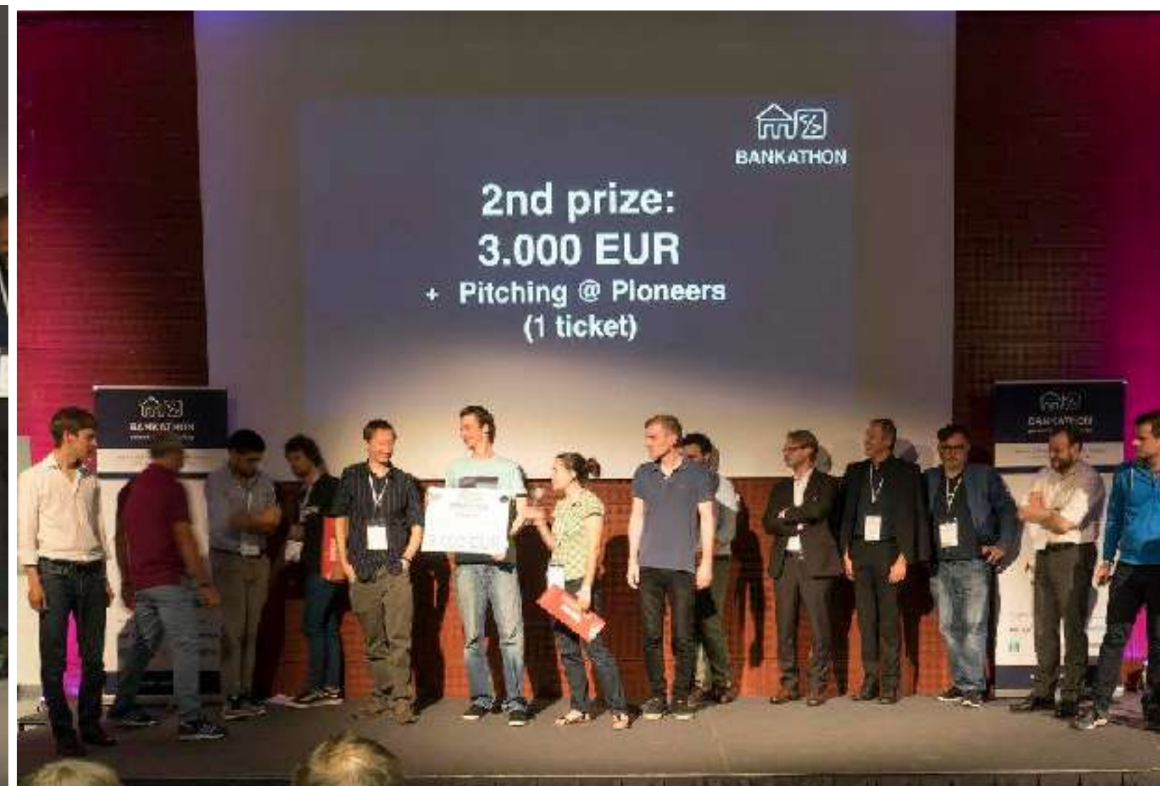
2nd Team B